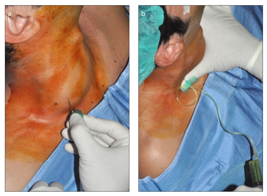
Figure 1. a, b. Percutaneous puncture of lymphatic malformation (a) and aspiration of lymphatic fluid (b).

years), with one patient having two different malformations with different symptomatology and esthetic issues.